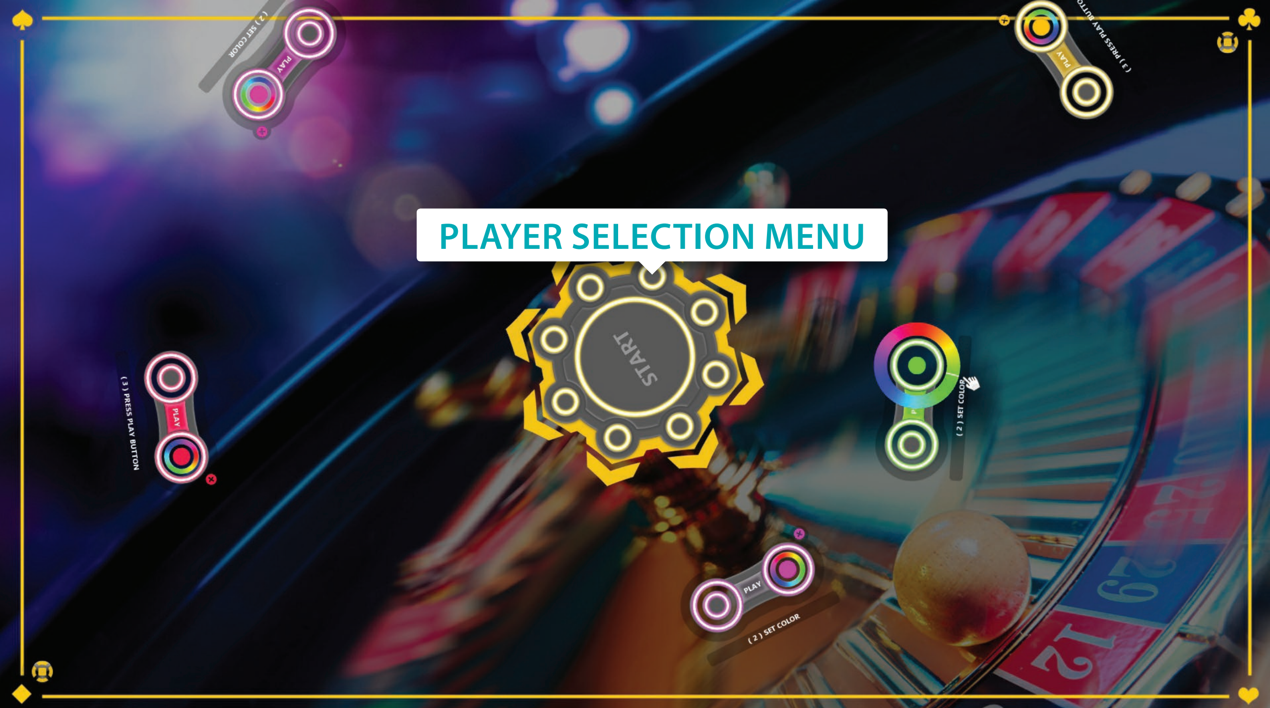
PLAYER SELECTION MENU